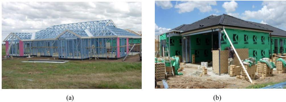
Figure 1: (a) Residential house framing with cold-formed steel; (b) Brick veneer house built with cold-formed steel

used for medium rise residential buildings in the United States. The numerous advantages offered by cold-formed steel have resulted in extensive application in both commercial and residential projects in the United States, with hundreds of thousands of residential houses built over the last two decades (SFA, 2007). For residential constructions in the UK, cold-formed steel framing techniques are often used for single occupancy dwellings, medium rise and multi-occupancy buildings (WRAP, 2008). Conventional detached housing is the largest single form of residential construction in Australia with approximately 120,000 built in 2015 as reported by the Australian Bureau of Statistics. A significant percentage of these houses were built using cold-formed steel structural framing in a typical brick veneer construction form as shown in Figure 1 for a detached house.