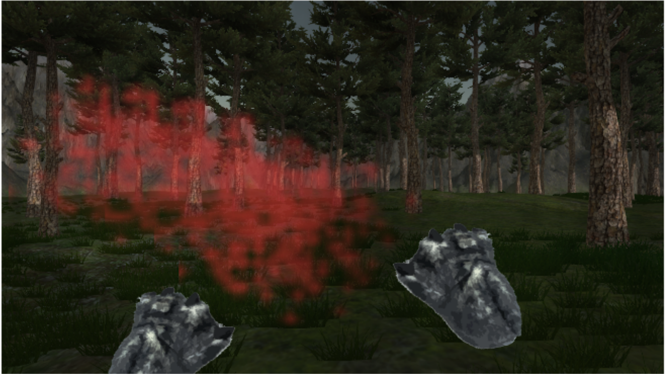
Figure 4: A user can activate the track ability when playing as the wolf. The track ability appears as a red mist which leads the wolf to the traveler.

the player in situations that hamper visibility such as dense sections of the forest. All items on the utility belt can be seen in Figure 3. This method allowed users to access their items intuitively instead of having them activate a menu, browse for an item, and then generating the item in their hands.