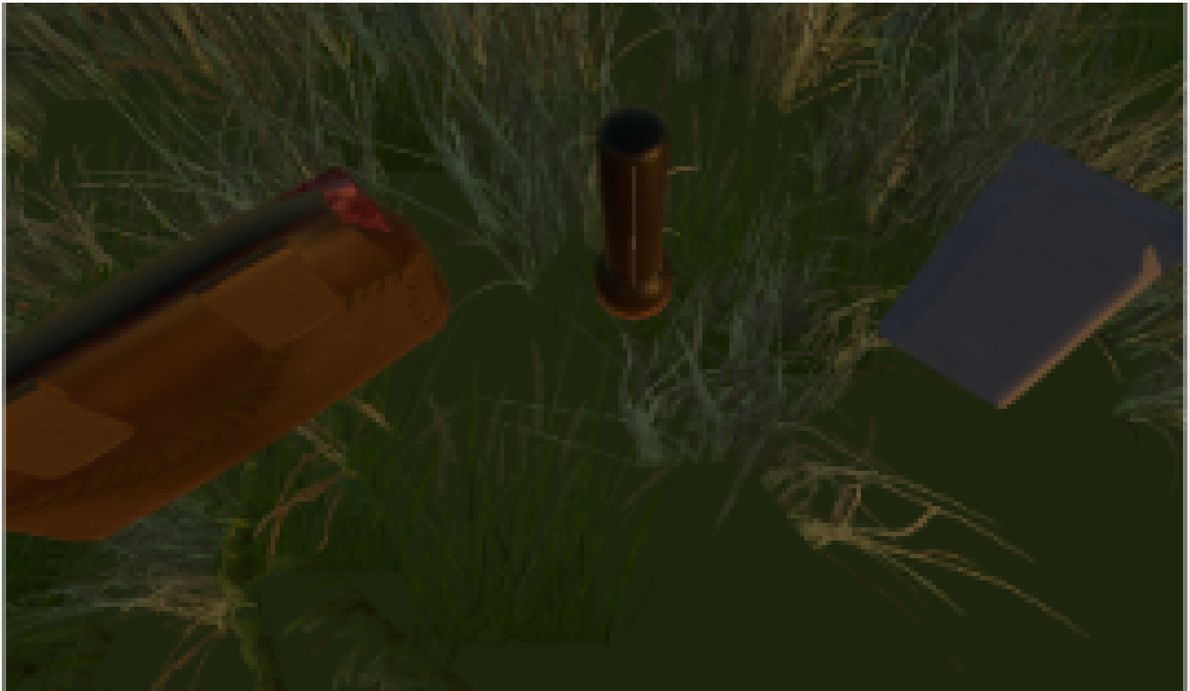
Figure 3: The utility belt which the player has when playing as the traveler. From left to right the belt contains bait, a flashlight, and a mobile phone.

will not be placed on top of a tree. The edge of the map is composed of mountainous terrain so that the player cannot see the edge of the map while establishing a boundary and the middle of the map is composed of a variety of tiles to create a unique landscape.