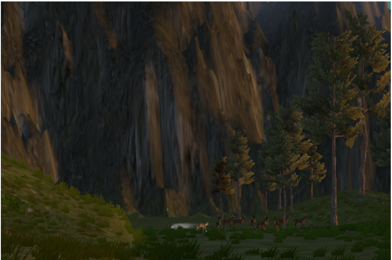
Figure 2: A wolf controlled by AI is chasing down a pack of deer. The deer are also running away from the wolf.

Another important software component within Wolf Hunt is the procedural generation of the map in which the player navigates. The choice to implement the procedural generation was made so that the user's familiarity with the map would lessen and to invoke a sense of waywardness that follows the theme of Wolf Hunt. An algorithm was conceived and implemented to provide this procedural generation. First a grid is formed to construct a map using the procedural generation process. The grid is then filled in using preset tiles consisting of different biomes. The biomes are placed randomly onto the grid and tiles placed next to each other are stitched together. The procedural generation process is implemented in such a way that the map mimics a realistic environment. For example, a pond