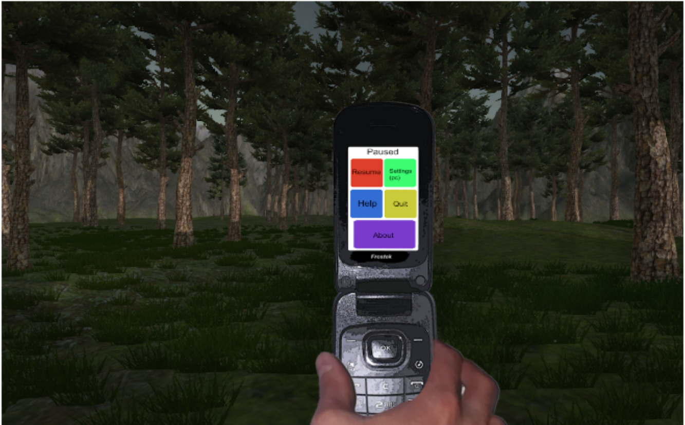
Figure 5: Shows the pause menu for Wolf Hunt. The user pauses Wolf Hunt by interacting with the mobile phone object.