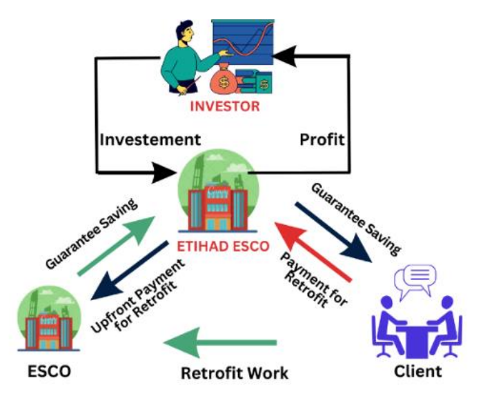
Figure 2 ETIHAD Super ESCO

Super ESCOs in the GCC region as shown in Fig.2, play a pivotal role in driving energy efficiency initiatives, supported by government backing to overcome market barriers that typical ESCOs face as shown in Figure 3. These entities facilitate large-scale projects by leveraging meticulously outlined ESCOs in the GCC, tracking their inception, operational regions, roles, financial strategies and including project financing and on-bill mechanisms. Additionally, it compares the focus on retrofitting versus solar projects. It identifies market segments each ESCO serves, providing а