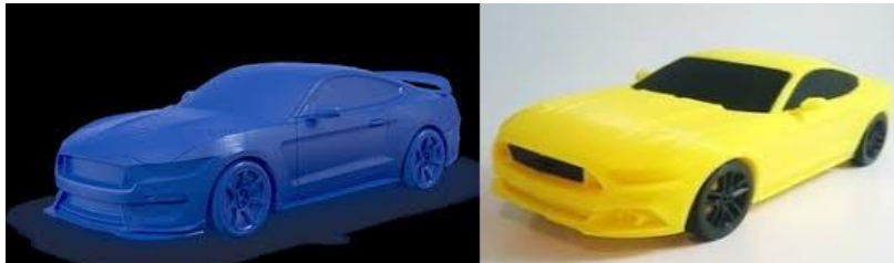
Figure 1. Design and printing of a product based PLA fiber using 3D printer.

Mentioning now the 3D industry, the PLA can be used for any product you may have a previous design computer and printed on this machine. This wide range of products ranging from small plastic pots to dishes and human prostheses or any design the user wishes to obtain (see Figure 1).