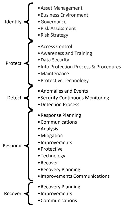
Fig. 1 NIST Cybersecurity Assessment Framework

The NIST guides organizations to evaluate and enhance their capability to identify, protect, detect, respond, and recover from cybersecurity attacks.