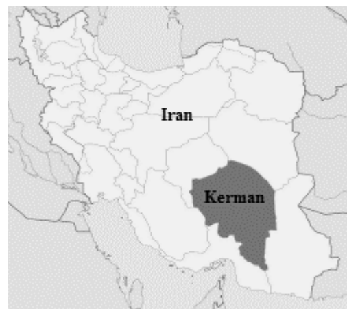
Fig. 1. Study area: Kerman, Iran

The current study focused on the farms located near the city of “Kerman” in Iran. Kerman is the largest province in Iran (area of 183,285 km 2 ), that embraces 11% of the land area of Iran (see Fig. 1). To meet the objective of the study, two types of data were collected: 1) agricultural production and 2) weather information. Spriter-GIS system used for the collection of data such as crop species, irrigation, and crop yield.