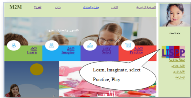
Fig. 2. M2M based on LISPP

While designing this system we aim to have a system that combine excitement with simplicity. This system includes a set of tutorials in both text and in video formats, with series and exercises that can be with or without solutions. It offers options that allow the student to study mathematics in a fun and not boring way by including educational games within it.