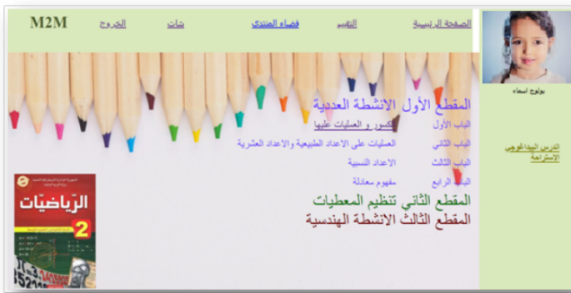
Fig. 4. First pair lessons (gates)

The mathematics curriculum for the second year of the middle school is divided into three pairs: "numerical activity - data organizing and regulating - geometric activity". Each pair is organized in the form of gates (lessons).